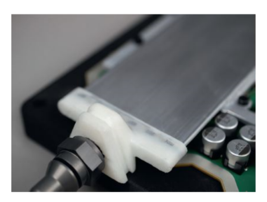
Detailed view of the connection technology of the prototype