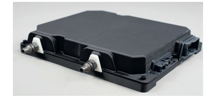
General view of the prototype